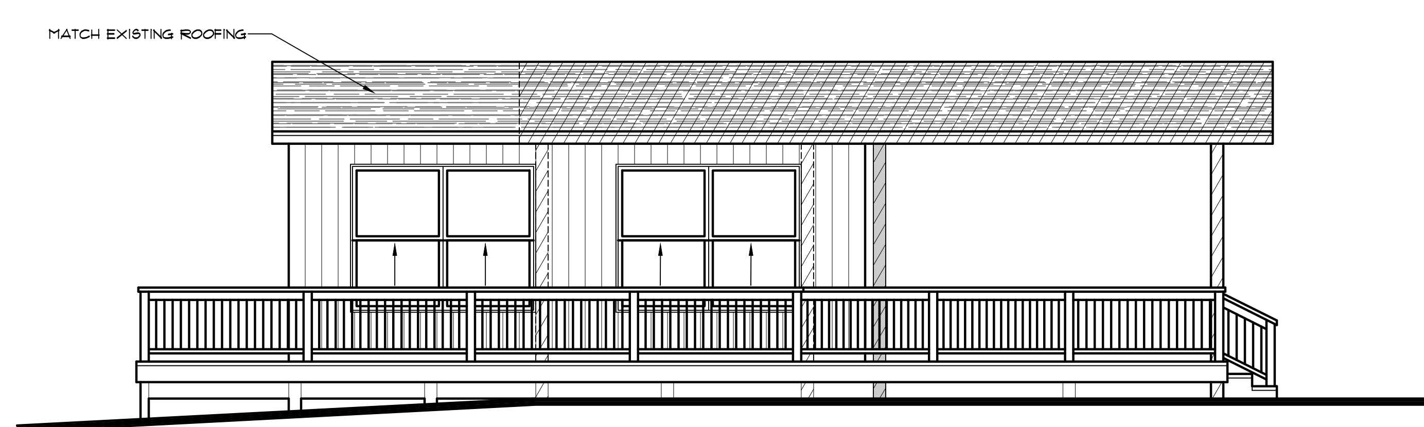
N.W. ELEVATION SCALE: 1/4" = 1'-0"